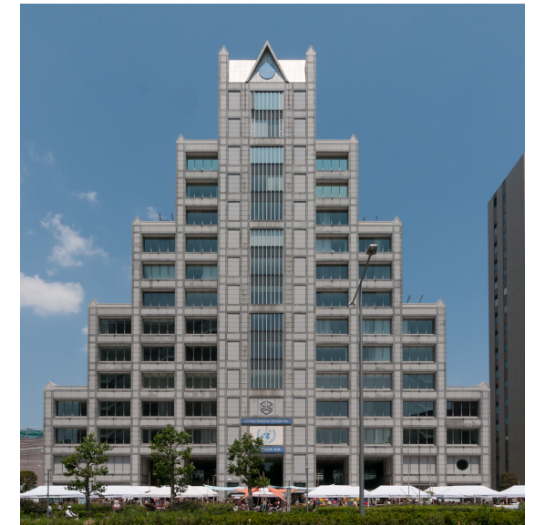
United Nations University, Tokyo, Japan