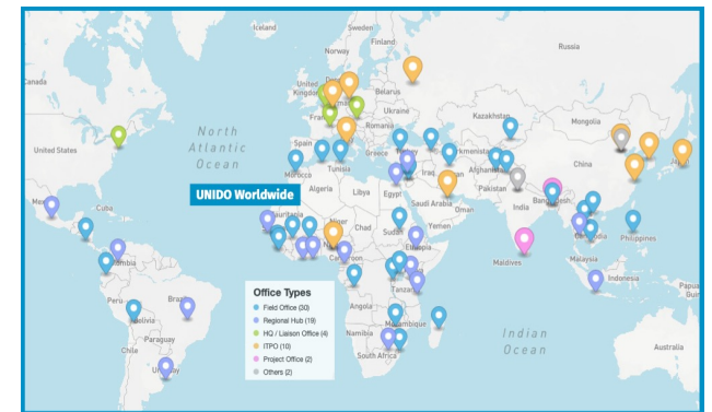
UNIDO has 48 offices around the world