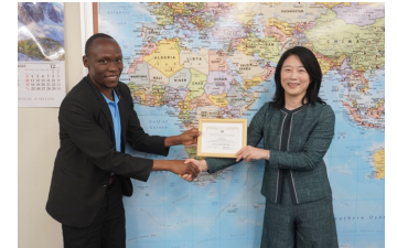
Award of certificate