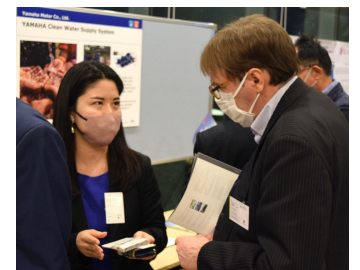
Networking, internship and/or recruitment opportunities with industry