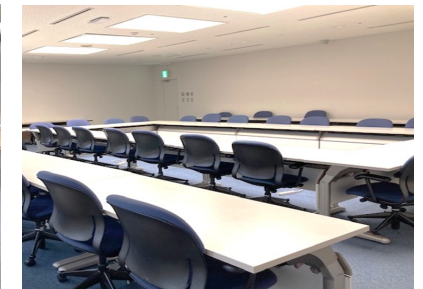
Programme Venue Images at the United Nations University