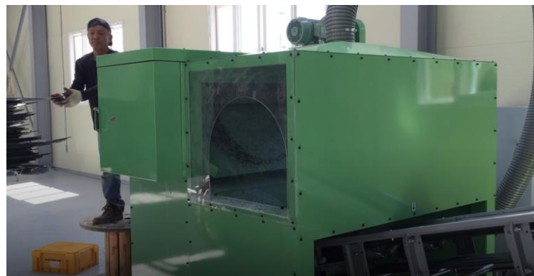
(EX) sheet glass