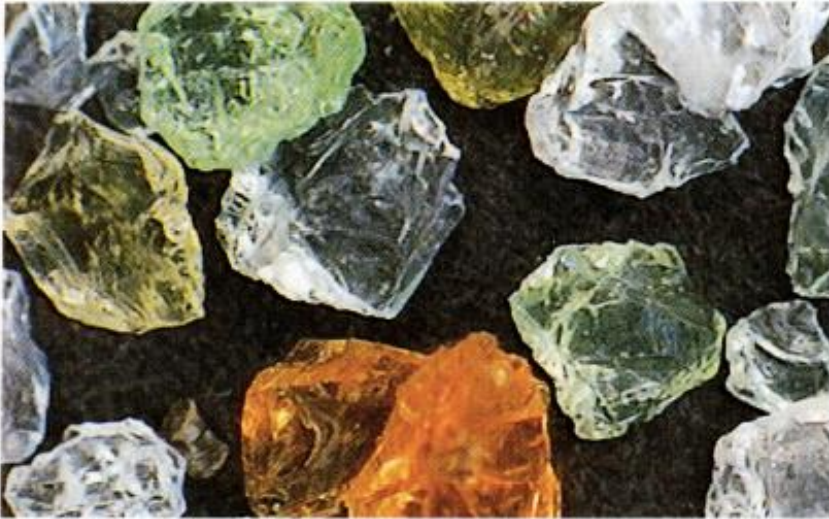
Glass sand by microsizer treatment

Microsizer is a revolutionary machine that can treat waste bottles and waste glass into square-handled particle sands that can be handled safely and provide them as new resources for various recycling businesses. Glass is made of \text{SiO}_2 , \text{Na}_2\text{O} , \text{CaO} , \text{Al}_2\text{O}_3 and other natural materials. By changing the particle size from 5 millimeters to 0.5 millimeters, it is possible to naturally return it without affecting water quality or organisms. Once we are able to return to nature, we expect demand in a variety of fields as well as sand. Cullet that is colored and cannot be returned to the raw material for glass bottles can also be recycled. As environmental issues become increasingly pronounced on a global scale, we are looking forward to the wider world under the theme of "friendly to the earth".