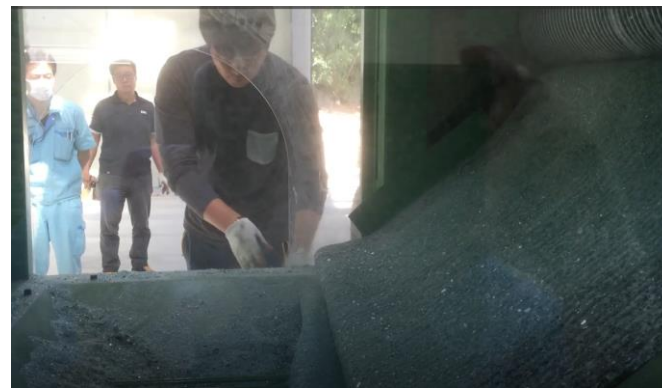
(EX) Laminated glass