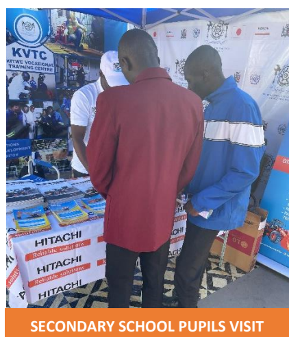
SECONDARY SCHOOL PUPILS VISIT THE STAND TO ENQUIRE ABOUT HEO COURSES