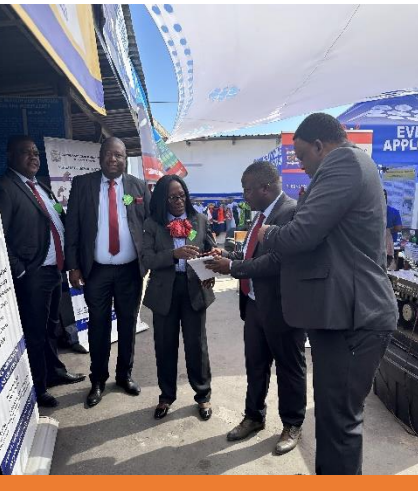
KVTC/HCMZ INTERACT WITH INDUSTRY