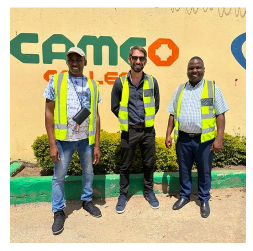
Group photo with the trainer – CAMCO