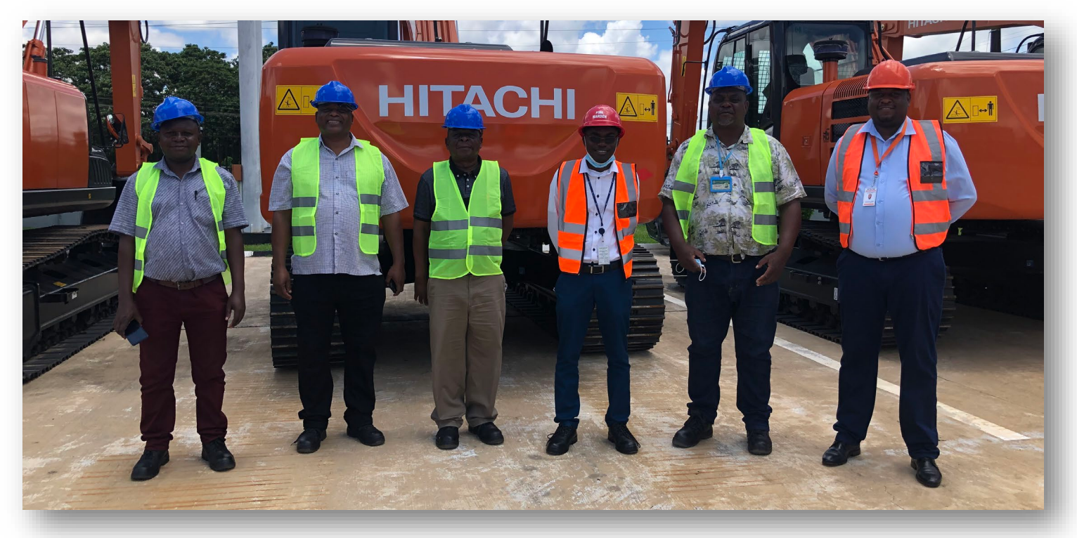
Training Zambian youths through a competence-based curriculum