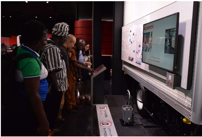
Isuzu Plaza in Japan