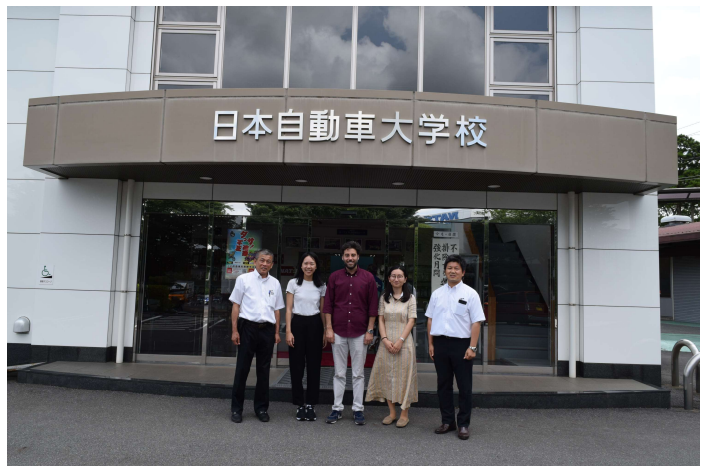
Nihon Automobile College (NATS) in Japan