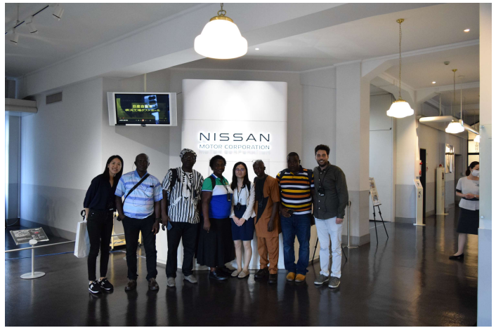
Nissan Motor Corporation Yokohama Plant in Japan