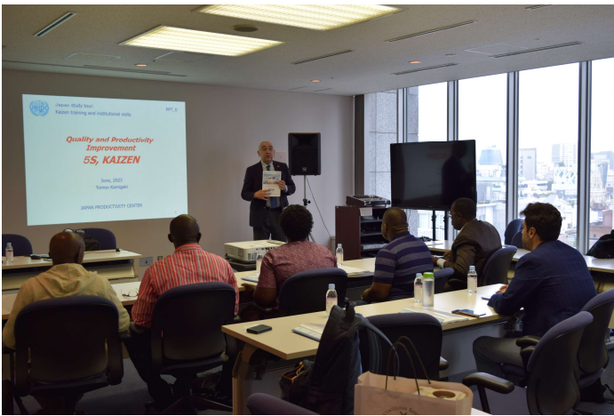
Kaizen Training by Japan Productivity Center at United Nations University in Japan