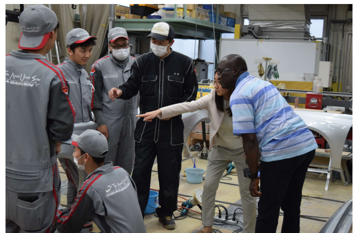
Ogura Gakuen Tokyo Automobile College in Japan