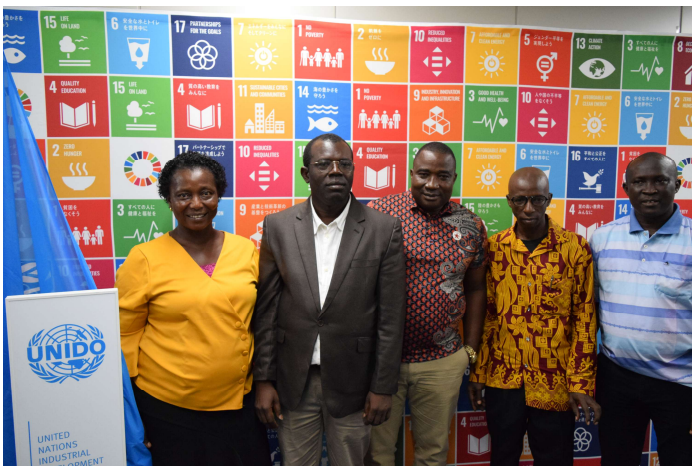
The Sierra Leonean delegation