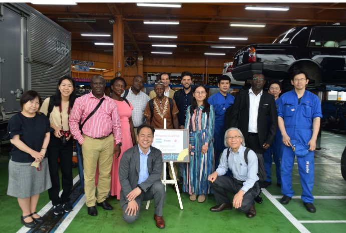
Nissho Jidosha Company in Japan