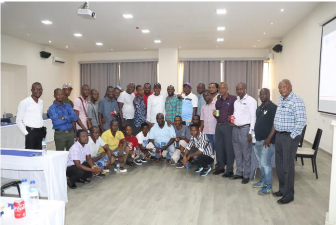
TNA & LMS workshop at Brookfields Hotel in Sierra Leone