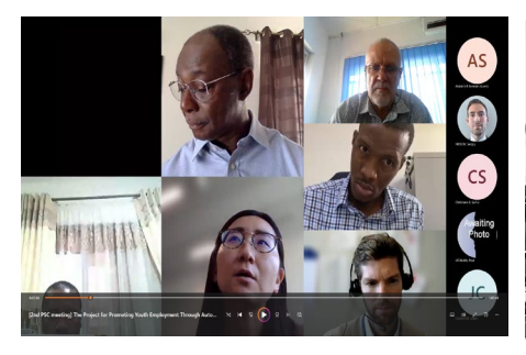
Project Steering Committee Meeting