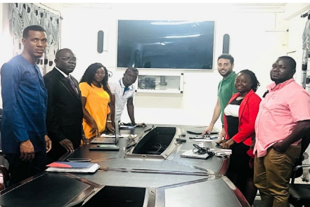
Meeting for Workplan Approval