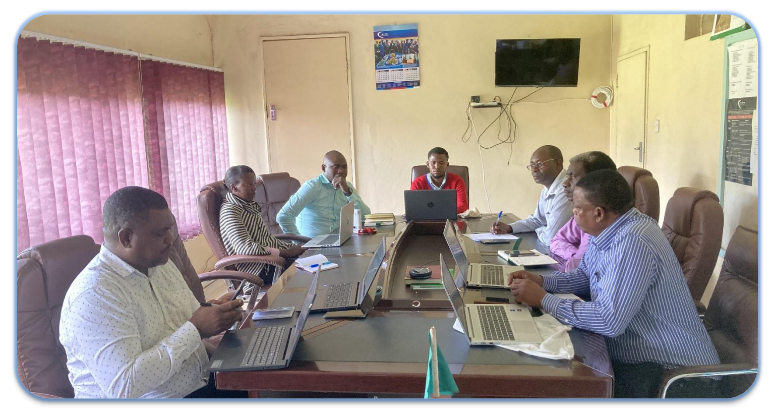
Photo of KVTC working committee during the online monthly update meeting with HCM