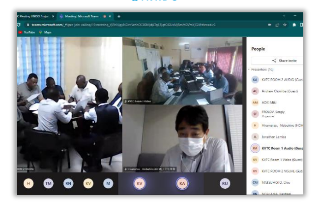
PSC meeting session