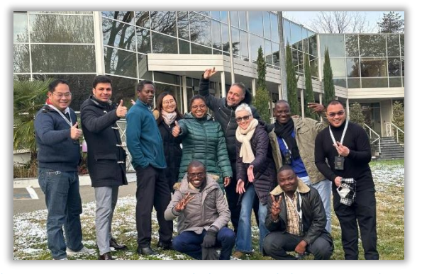
Project staff and other training participants during the Digitalization of VTC's systems training at Turin, Italy

UNIDO Project Office Kitwe Vocational Training Centre (KVTC) Email: <u>zm-kvtc@unido.org</u> Phone: +260977437131