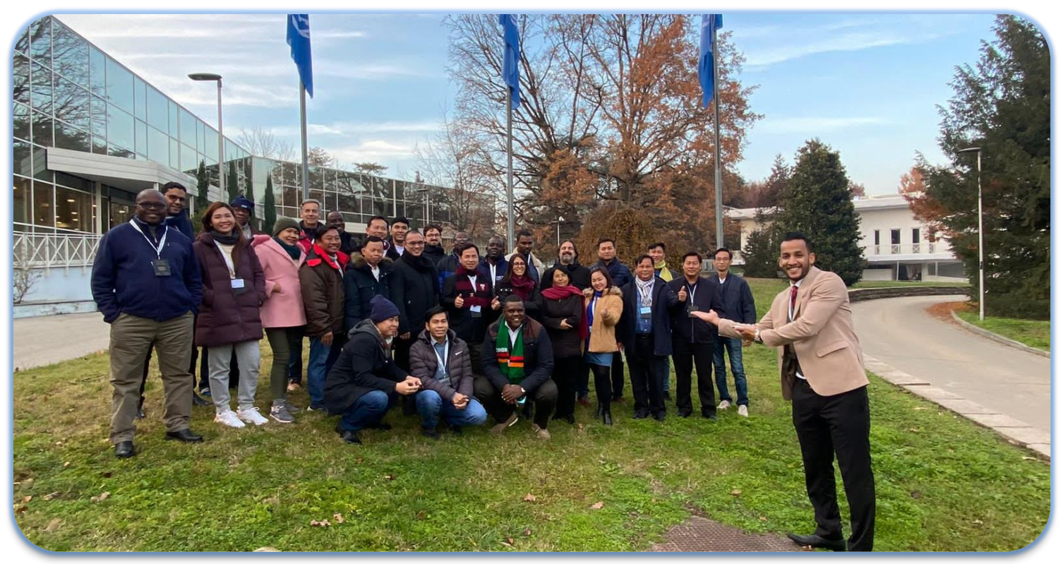
Group photo of the participants in the Management of Vocational Training Centre training at ITC_ILO Turin, Italy