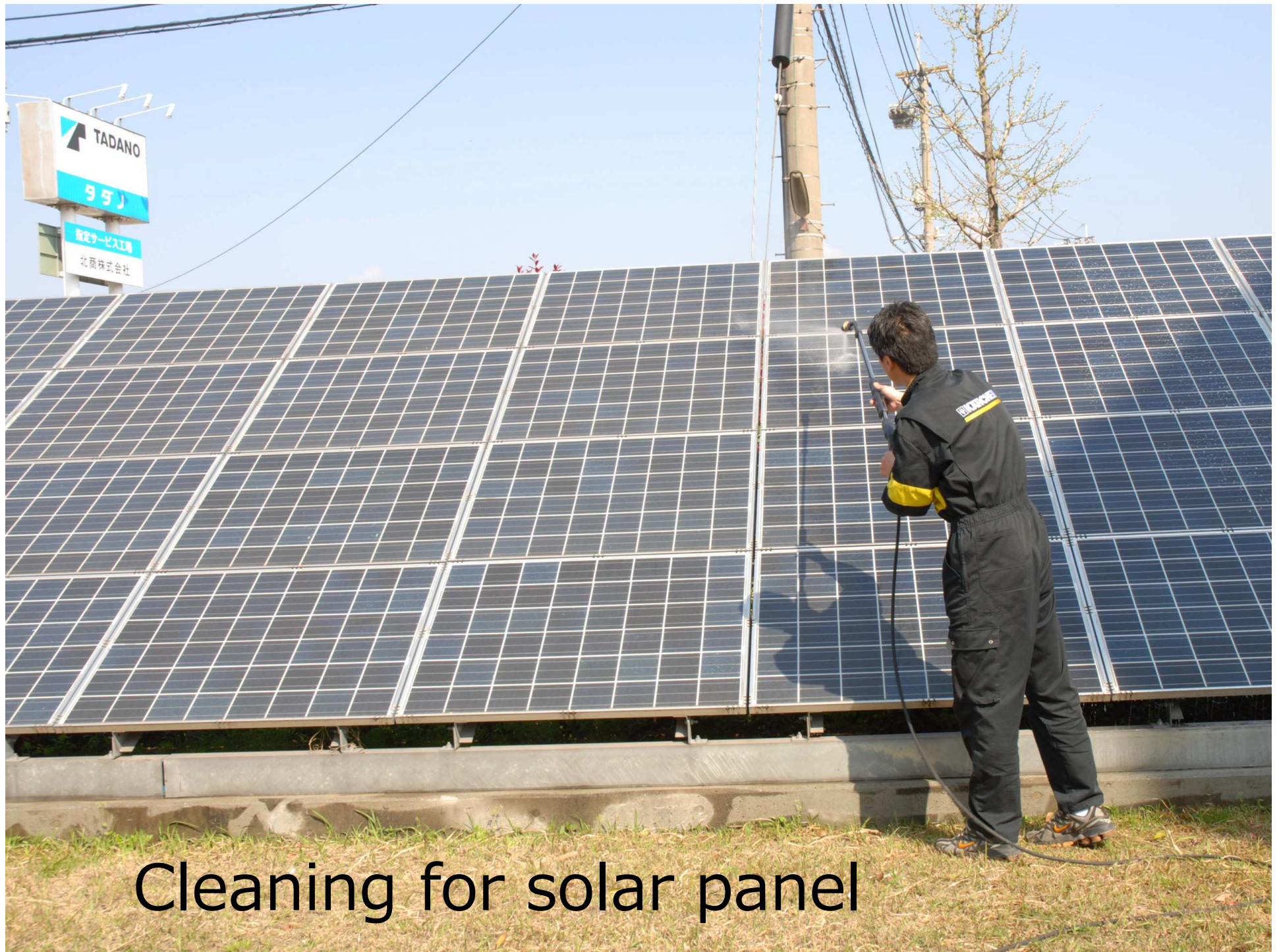
Cleaning for solar panel