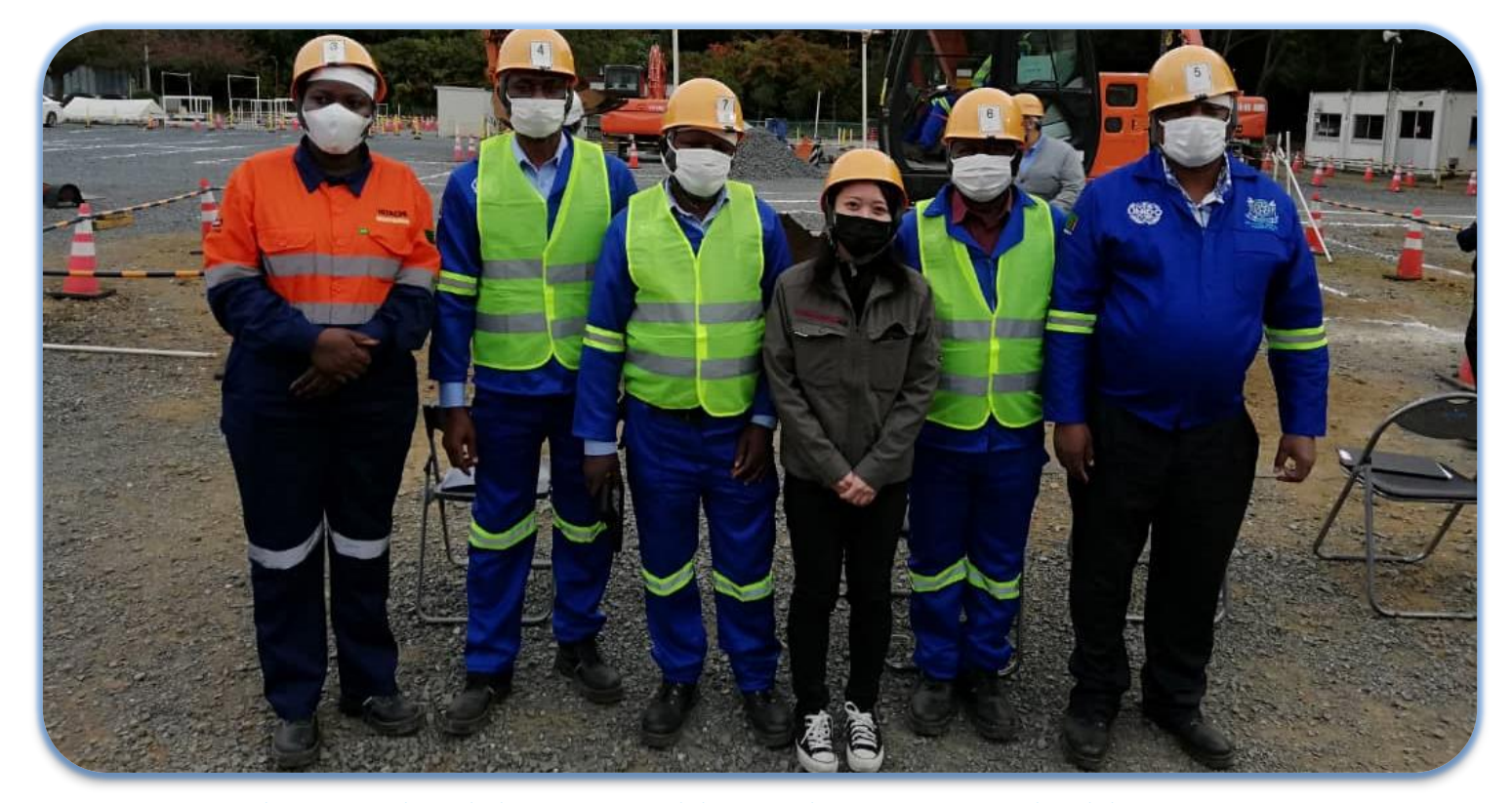
KVTC HEO trainers' capacity building through training of trainers at PEO Ibaraki Training Centre, Japan