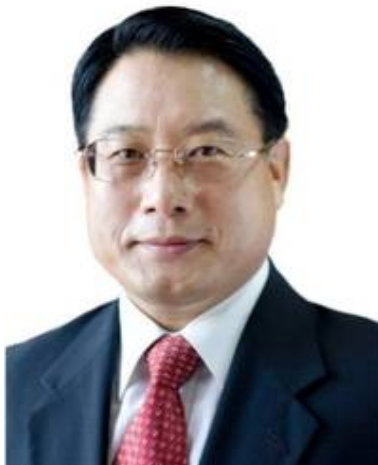
Director General LI Yong