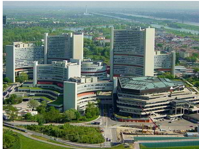
UNIDO HQs in Vienna, Austria