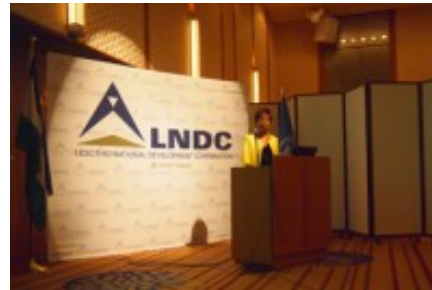
Lesotho Business Seminar