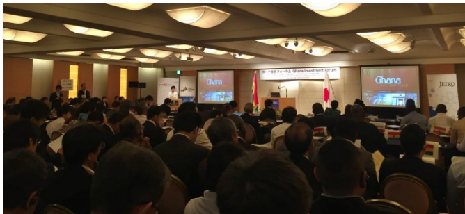
Ghana Investment Forum