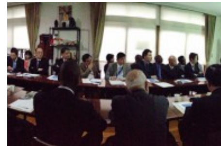
Uganda Business Roundtable