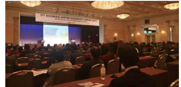
ECOWAS-Japan Business Forum