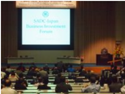
SADC-Japan Business Forum

Often under Delegate Programme, country-highlighted investment and business promotion seminars are organized in collaboration with Japanese bilateral organizations such as JETRO and JICA, aiming at updating knowledge of business people about the investment climate of the target country.