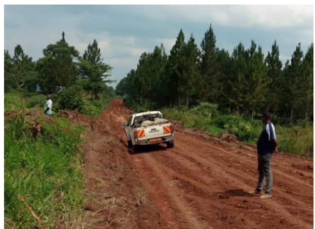
MoWT conducting due diligence at the project site