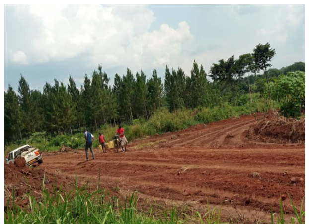
Roads from highway to the project site improved © MoWT