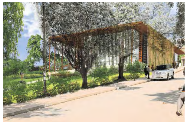
Met and vetted climate friendly construction companies

Met and vetted climate friendly construction companies