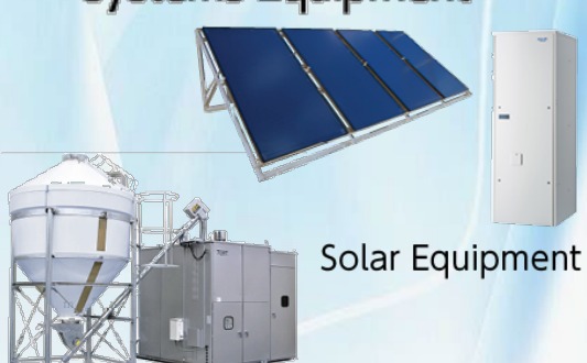
Wood pellet-fired absorption chiller-heater