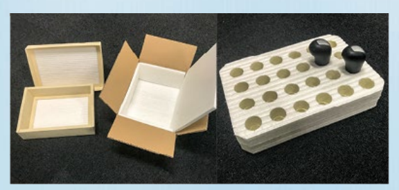
Paper foam cushioning material