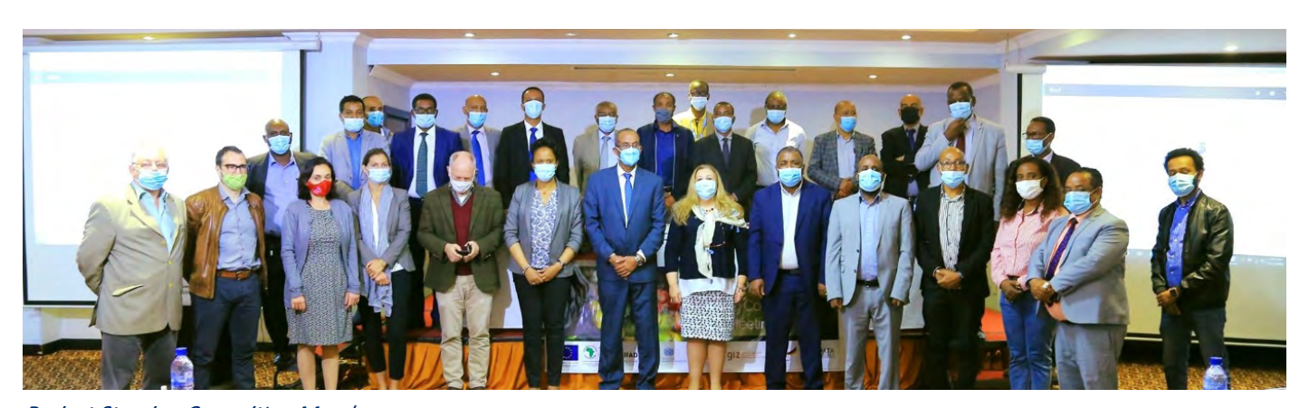
Project Steering Committee Members

IAIPs also help in lowering the costs by reducing post-harvest losses, transportation costs, and energy costs. These parks also ensure higher returns due to high-quality output, off-season availability, better traceability, and enhanced productivity. It is believed that successful implementation the IAIPs would accelerate the economic transformation process of the country.