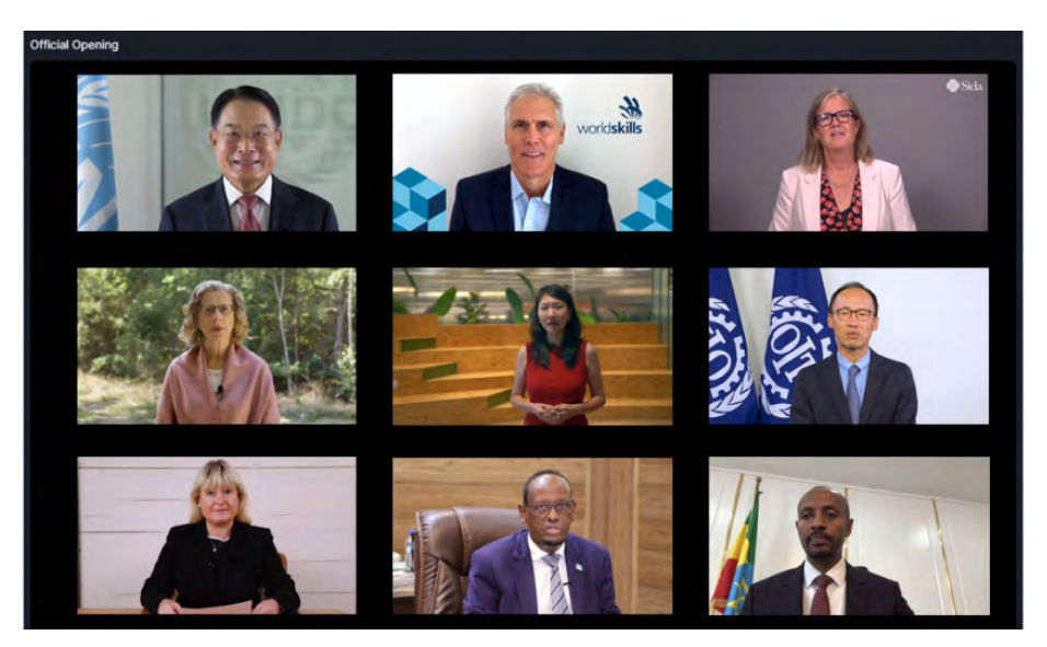
Participants in the webinar

The discussions also highlighted several challenges, including lack of inclusivity in technical education, limited green policies at local and global levels, a narrow focus on outcomes and impact when investing in education, and little context-specific results.