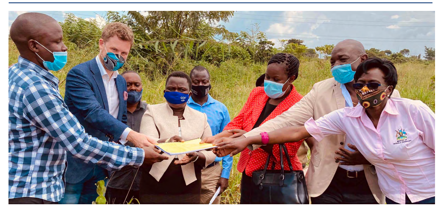
Representatives from the Ministry of Works and Transport (MoWT) of Uganda and UNIDO at the handover ceremony at the project site in Luweero district

To address the industrial skills gap in Uganda, the Government of Japan, the Government of Uganda through the Ministry of Works and Transport (MoWT) and the United Nations Industrial Development Organization (UNIDO), with technical support from Japanese partner Komatsu Ltd., are building the first dedicated training centre for road construction equipment operators in Uganda. The land for the training centre in Butuntumula, sub-county in Luweero district, has been officially handed over to the MoWT on 17 November 2020. In recent years, the Government has procured road construction maintenance equipment, such as motor graders, wheel loaders, excavators, bulldozers and backhoes, and distributed them to District Local Governments across the country. The new training centre will allow matching this